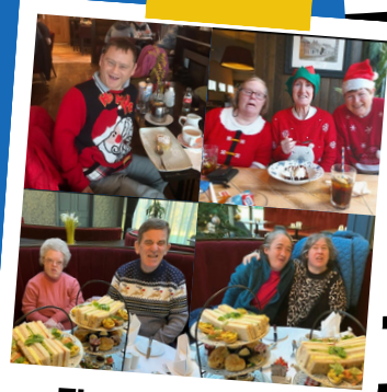
Thanks a Brunch!

Over December we all went for Christmas lunch with our keyworker group. Some of us enjoyed afternoon tea in the City North hotel while others went to Wetherspoons, Hogs & Heifers and Kettles Country House for a slap up Christmas lunch! We all had a great time and it was a lovely way to finish off a great year!