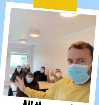
All the gang!