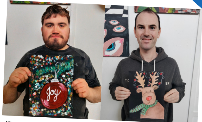
Winners of the IDS-TILDA and HSE-EVE Christmas Card Art Competitions 2022!