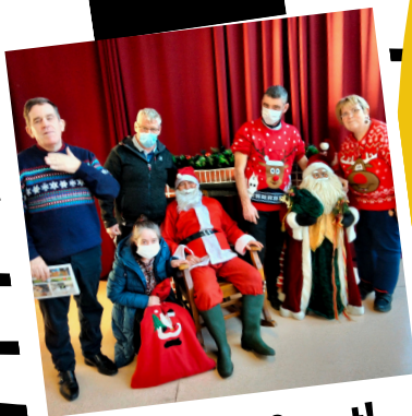
A Special Guest!