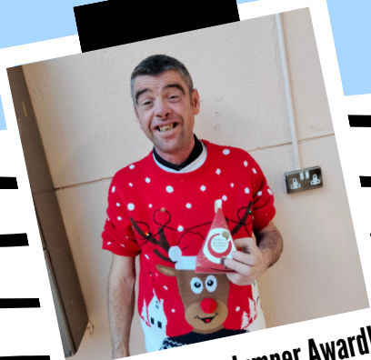
Best Christmas Jumper Award!