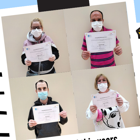
Some of this years competition finalists!