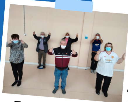
The New Rep. Committee!

We are delighted to announce that our new timetable came into effect on the 16th of May offering service users a host of new choice based activities such as: Personal hygiene, healthy lifestyle, self care, horticulture, allotment, arts and crafts, media, gym, football, cycling, bocce, floorball, pitch and putt, walking club, tennis, snooker, bingo, men's & women's groups, cookery, social club, computers, music and the ability programme. We are also delighted to introduce our new rep. committee.