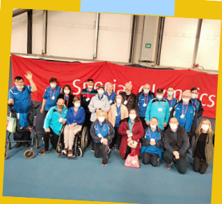
'We are the Champions'

Over the past couple of months our athletes have taken part in The Special Olympics Badminton, Bocce and Athletics Regional Advancement Competitions and we are so proud to share with everyone that so far we have won 13 Bronze, 8 Silver and 8 Gold medals which is an unbelievable achievement. A huge congratulations to everyone who has taken part so far!