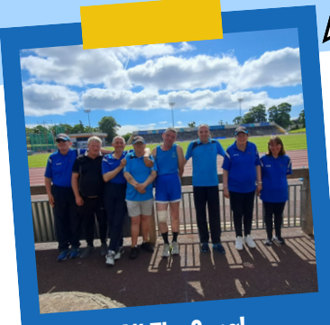
All The Gang!

Thank you Tennis Ireland for organising such a fun trip!